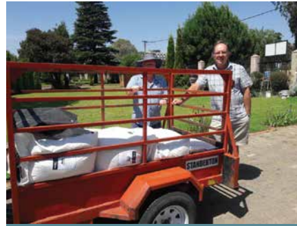
Our very first delivery in 2018

As the foundation progressed with meal development, Org started advocating for funding to build a cereal cooking factory. In April 2020, the foundation received a significant donation of R7mil from a philanthropist based in Switzerland, which allowed for the construction of the StartWell extrusion plant in Springs, Gauteng. This new plant has the capacity to feed more than 200 000 children a daily StartWell portion. By July 2021, the foundation