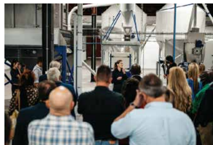
StartWell Factory launch 2021

had produced its very first StartWell cereal, and with its new factory, it could start expanding its reach and feed more children.