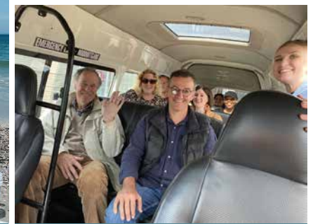
ECD visits with the Noakes Foundation in Gugulethu 2023