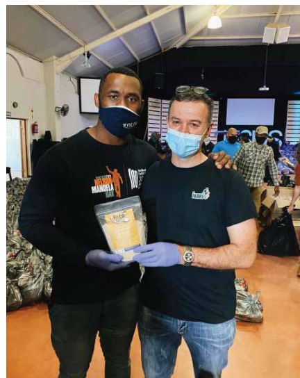
Mandela Day 2020 with The Kolisi Fondation