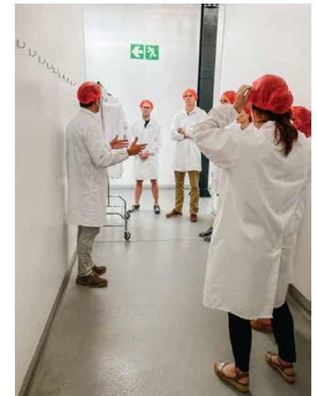
Factory visits with King Price 2022