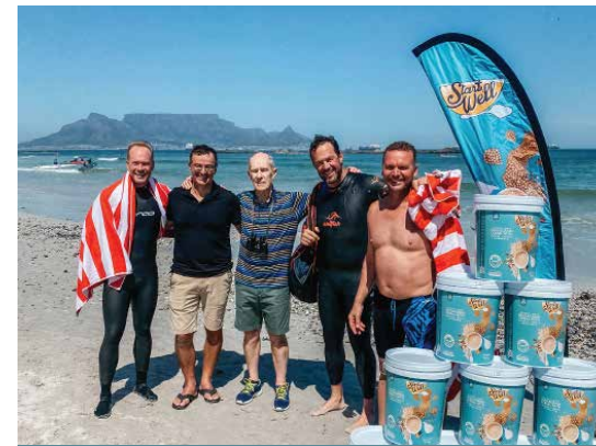
Fund raising event in 2023 with Nika Capital & King Price

The Inani StartWell Foundation is committed to making a positive impact on childhood nutrition in South Africa, and it has already made significant strides in achieving this goal. By supporting this foundation, you can help improve the lives of thousands of children and contribute to a brighter, healthier future for South Africa.