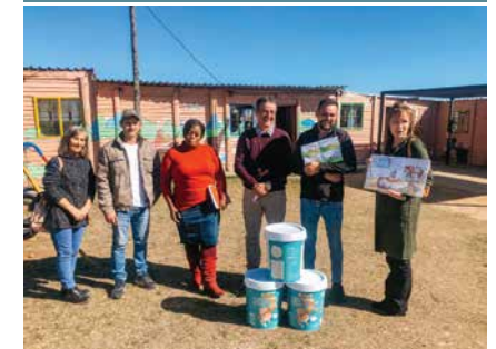
The start of Sapiro village project in Sasolburg 2022